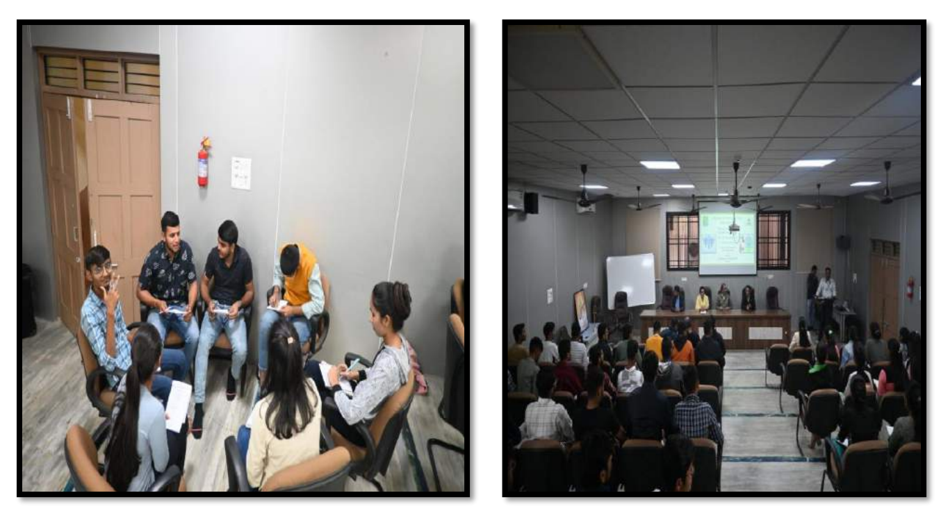
Personality Development Workshop by SHURUD : Counselling and Coaching Life skills, Vadodara during 20<sup>th</sup> -22<sup>nd</sup> December 2023.