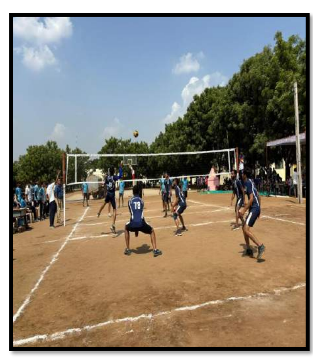
Intercollegiate Volley ball competition - 2023-24 (Men & Women)